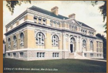
Library of the New Britain, 1853, New Britain, Conn.